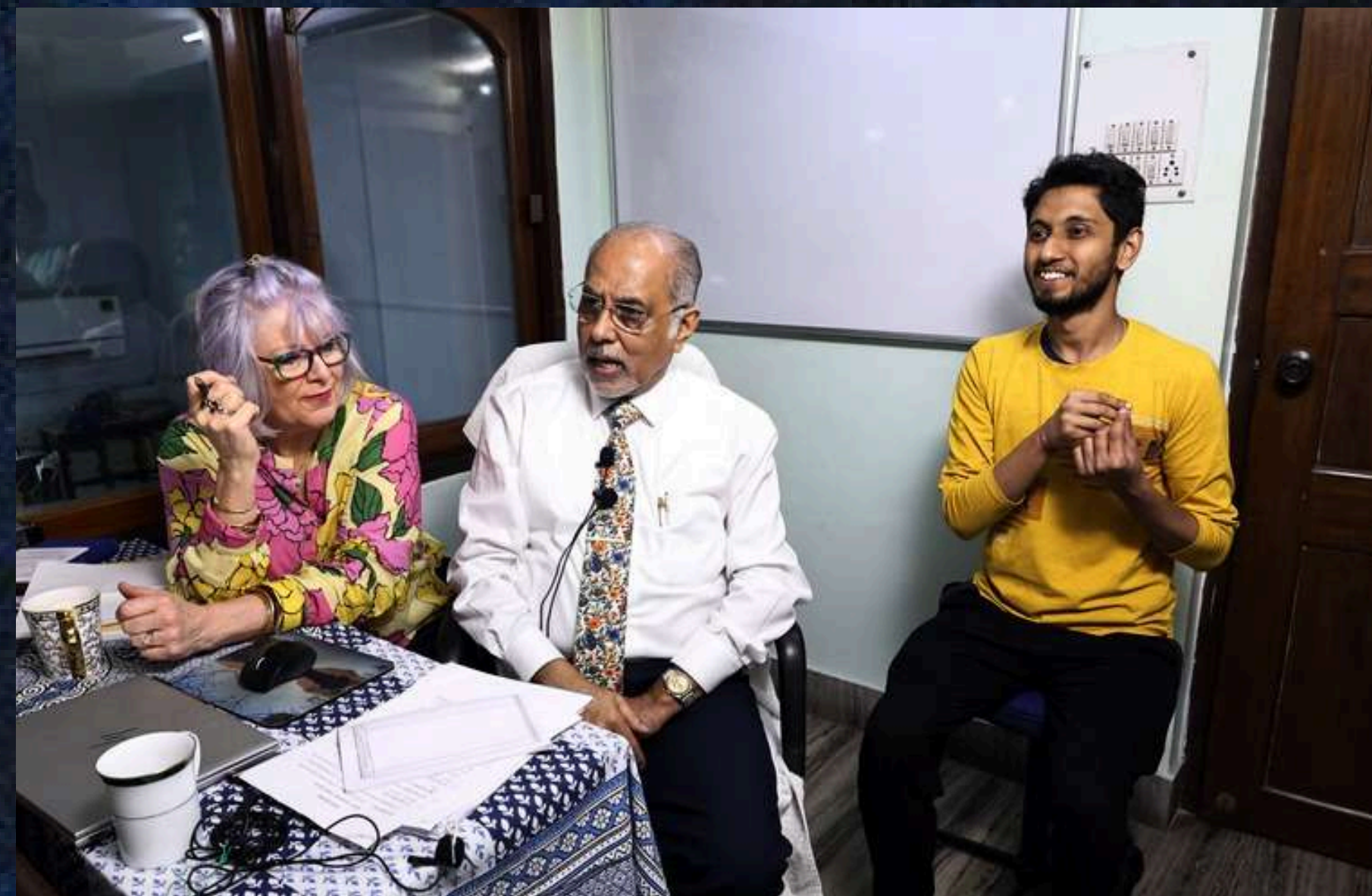
Patient & Practitioners are smiling; Trembling, 70% better: Calcutta Clinical Programme 2025.