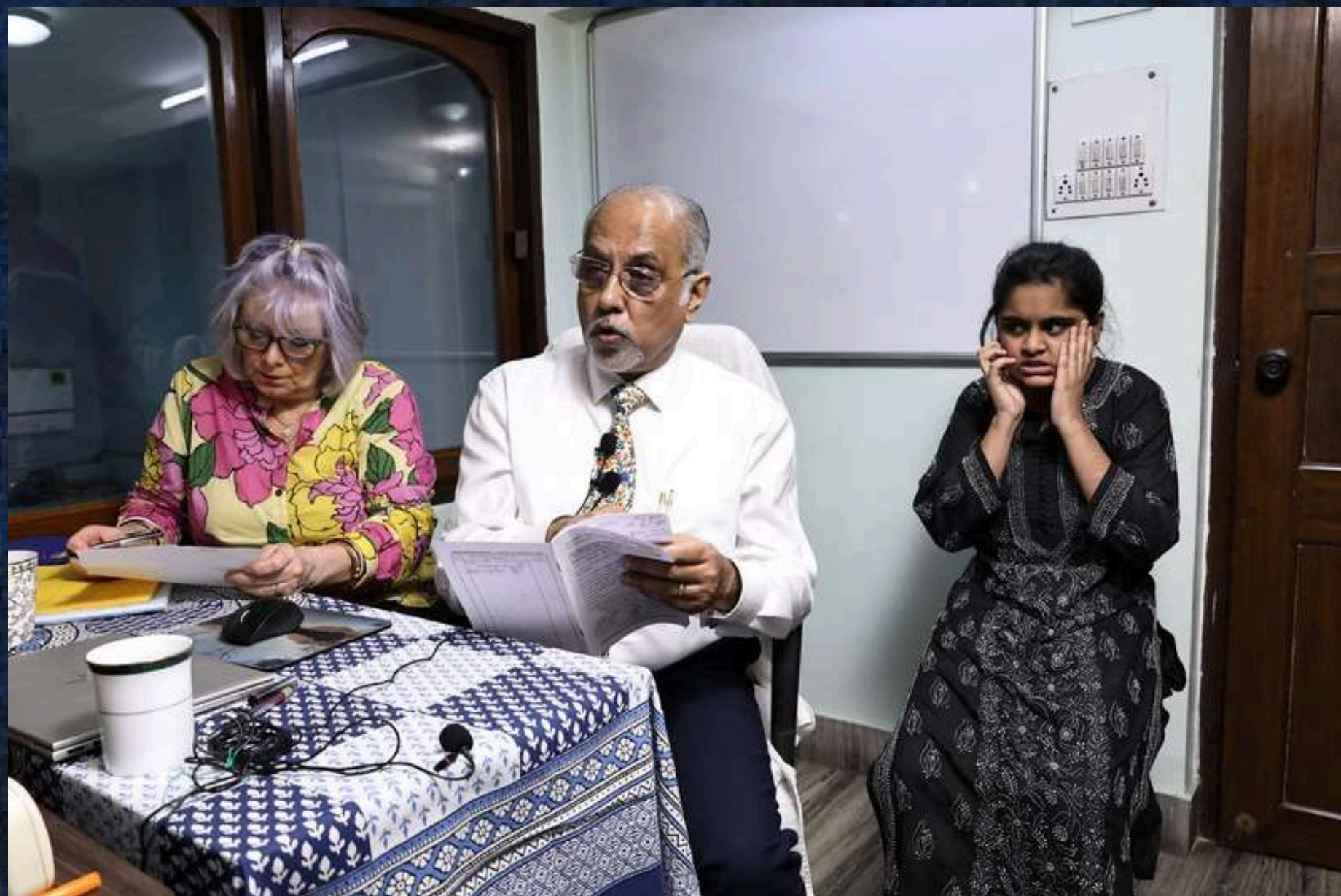
Behavioural Materia Medica: Spot the Medicine: A Baryta Case.