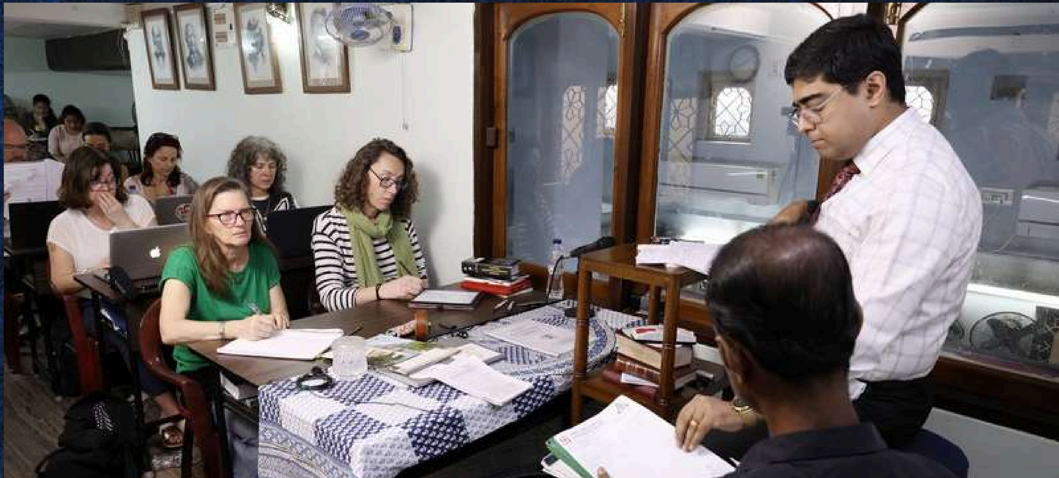
Live case demonstration with interpretation of medical reports before and after homoeopathic treatment, Calcutta Clinical Programme 2025.