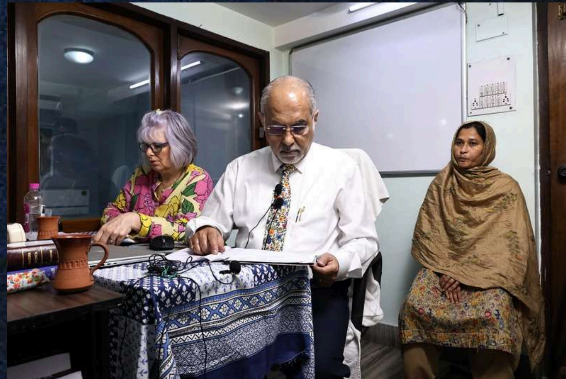
Perhaps the ONLY programme in the world, which demonstrate 160+ LIVE non-edited cases in 10 days, where live interaction with patient is encouraged.