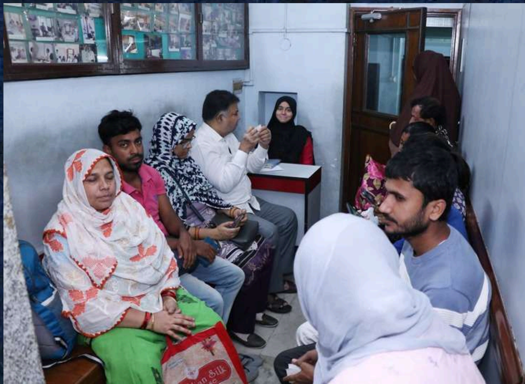
Patients patiently waiting to be seen.