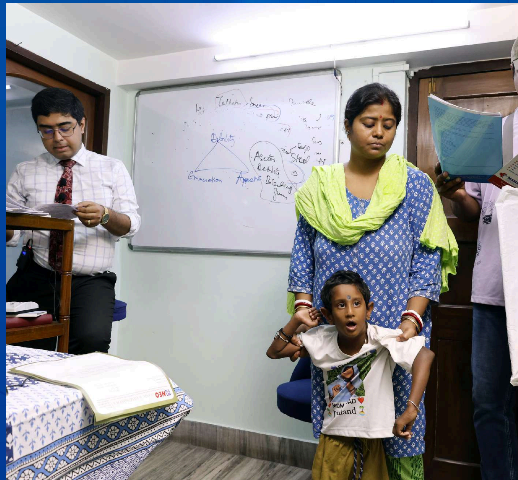
Many Autistic & ADHD cases were seen & demonstrated the improvement through "Simple Classical Time tested Hahnemannian-Kentian Homoeopathy". This course takes you back to the foundations and principles through which homoeopathy survived 200+ years.