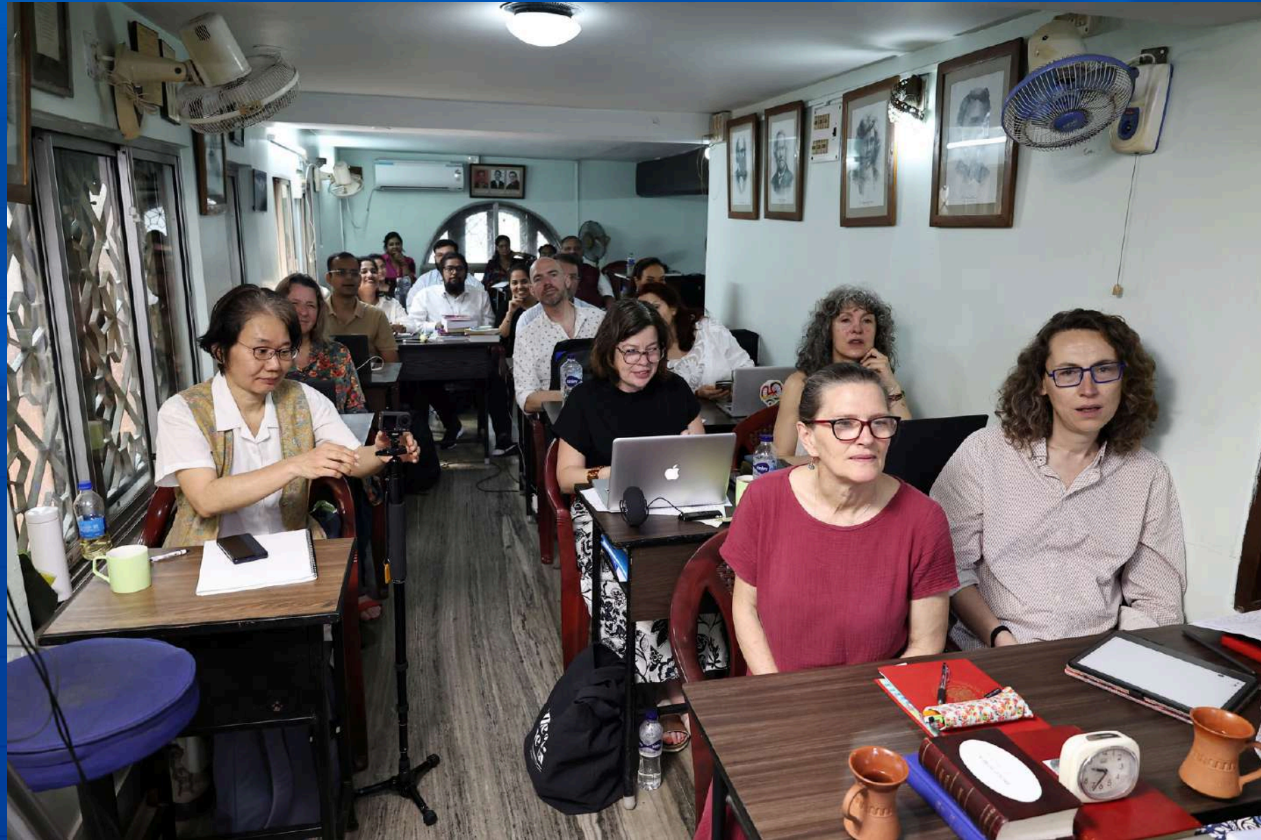
Participants from the United Kingdom, France, Greece, Japan, Brazil etc. and some Indian Doctors attended the programme.