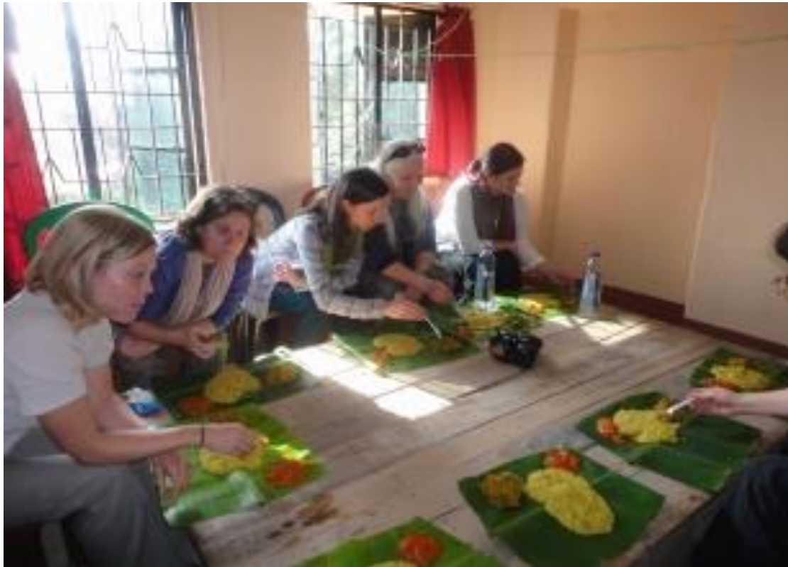
A deserved wholesome lunch served on banana leaves, after a morning of 35 patients