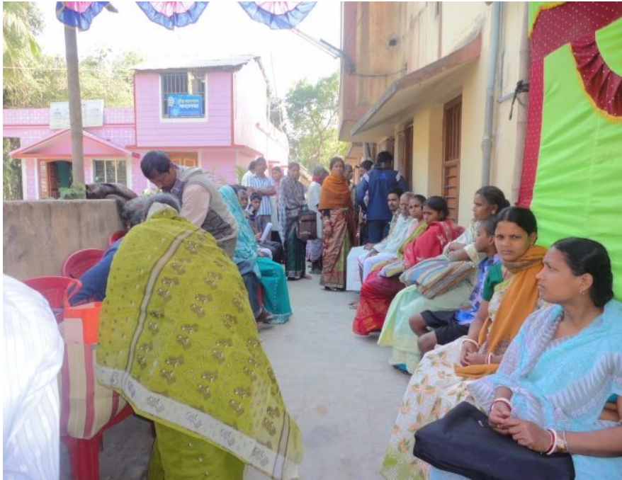
Patient's waiting area in Khejuri village